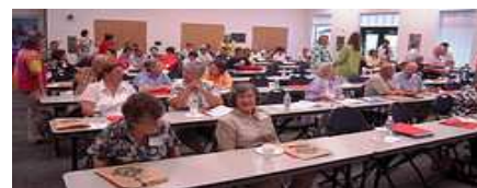
Happy Genealogists: Getting Educated