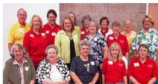
ETGS Smiling Faces Say It All!